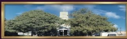
Saint Anthony of Padua 133 5th St, Hugo, CO 80821