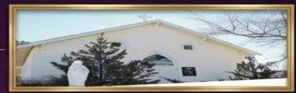
Saint Mary Flagler Fourth and Loveland, CO 80815

(719) 408-0077 - Call, Voicemail, Text, Church email: olvictorylimon@gmail.com, Website: https://olvlimon.diocs.org, Facebook: https://www.facebook.com/victorylimon