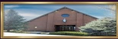
Our Lady of Victory (OLV) 425 H Ave Limon, PO Box 790 CO 80828